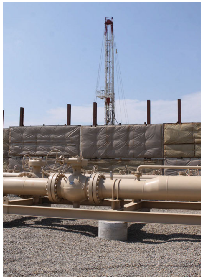
Developing a new oil or gas site can have “nuisance” impacts on nearby residents, including higher levels of noise, dust, bright lights, and traffic. Local jurisdictions might implement regulations to address these impacts (such as the padded sound barriers seen here).

Property taxes. Property tax is one of the more stable, predictable forms of revenue related to oil and gas development that is available to, and controlled by, local governments. Even in states where oil and gas production property is exempt from property taxes, non-production property, such as oil and gas industrial facilities and corporate offices, is taxable.